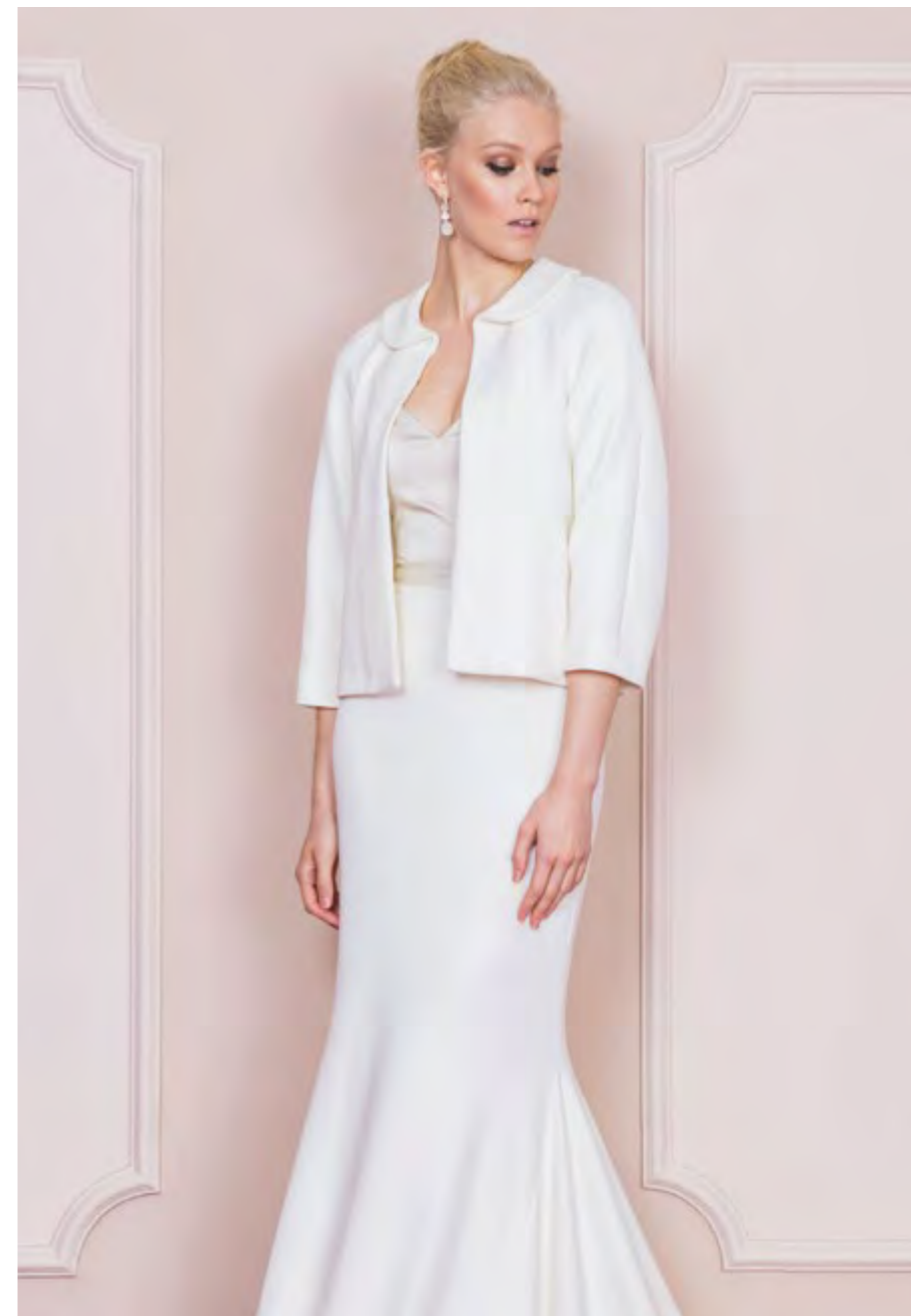
40613 Edda jacket