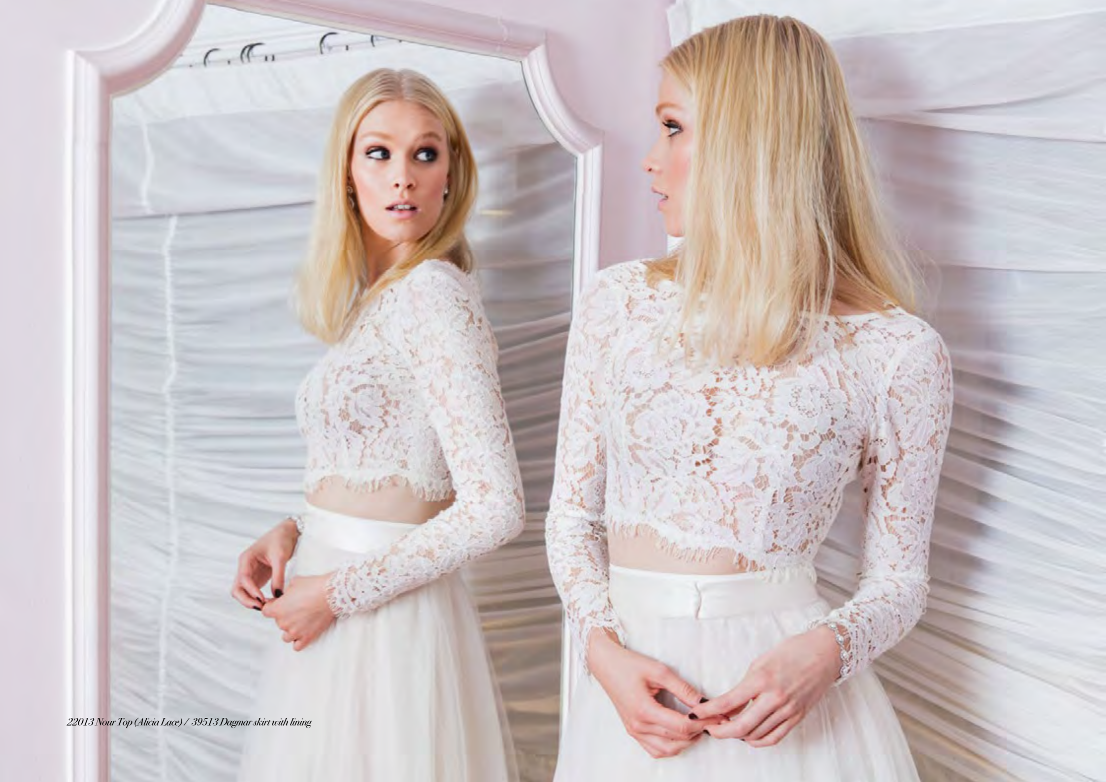
22013 Nour Top (Alicia Lace) / 39513 Dagmar skirt with lining