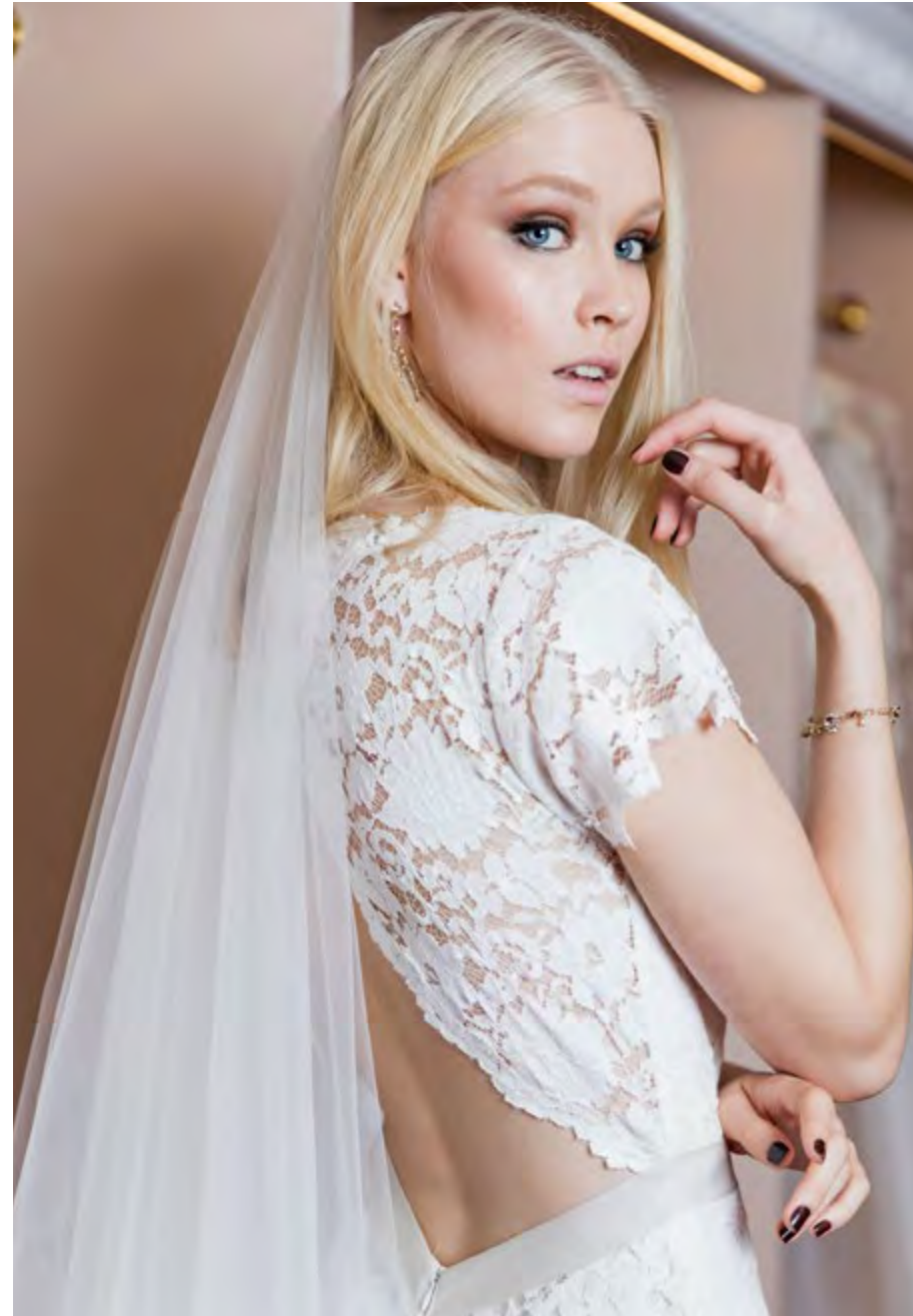
35665 Ashley Dress / 30565034 Plain Veil Short