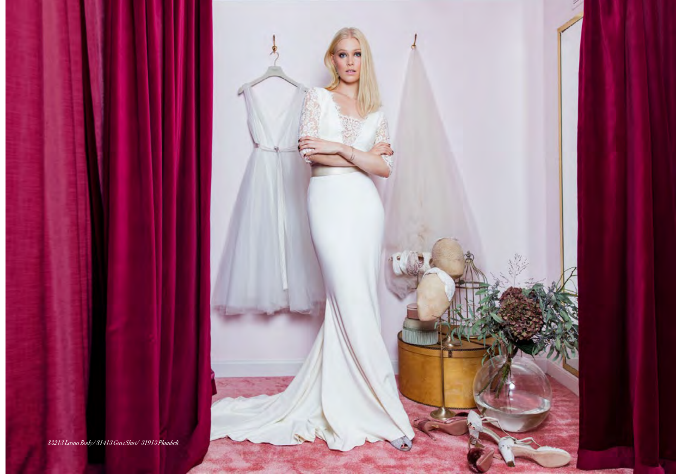
83213 Leona Body / 81413 Gavi Skirt / 31913 Plain belt