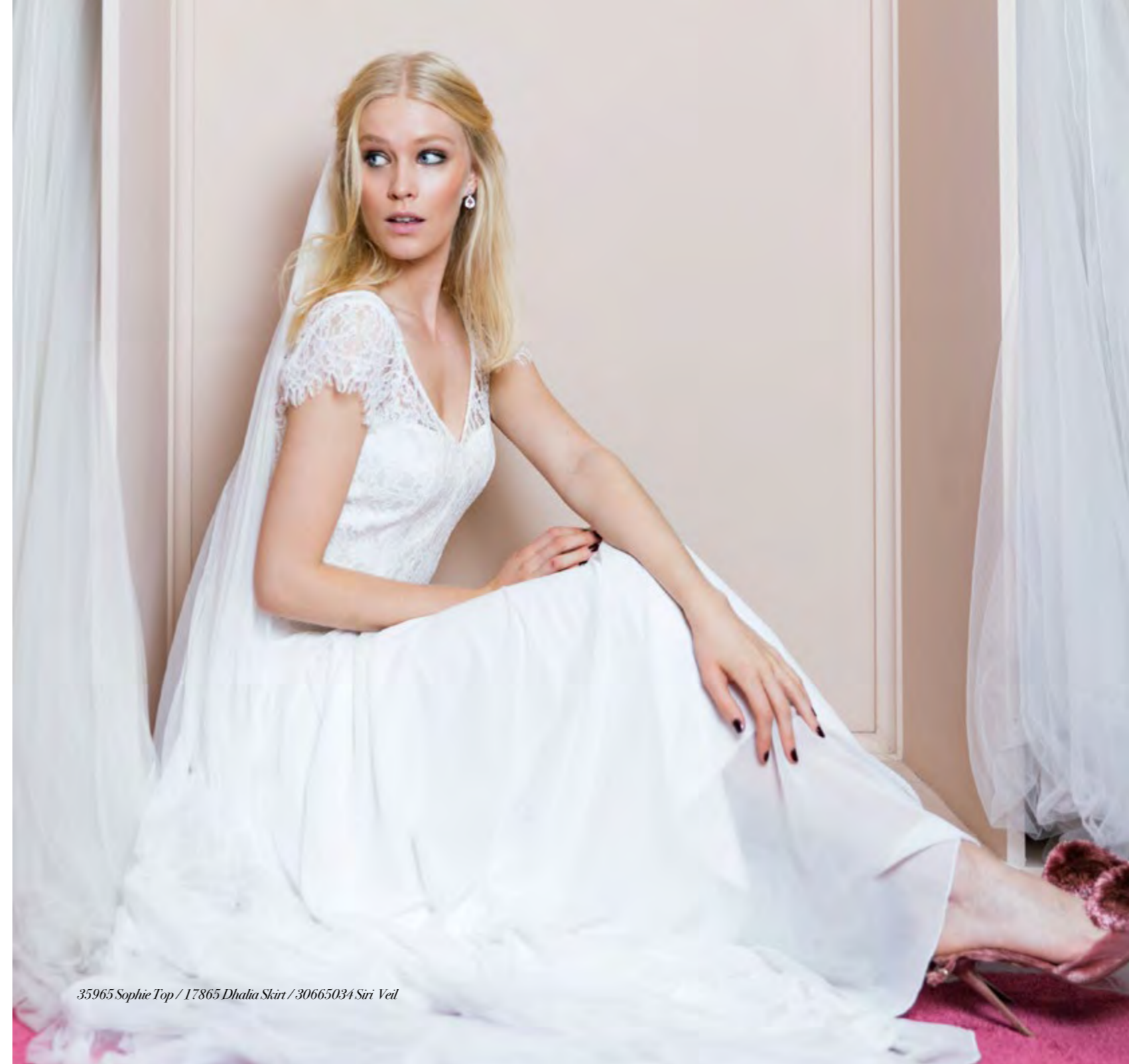
35965 Sophie Top / 17865 Dahlia Skirt / 30665034 Siri Veil