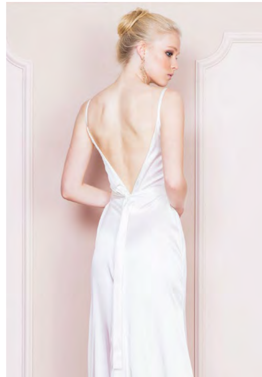
36765 Lulu Dress/ 28865 Silk ribbon