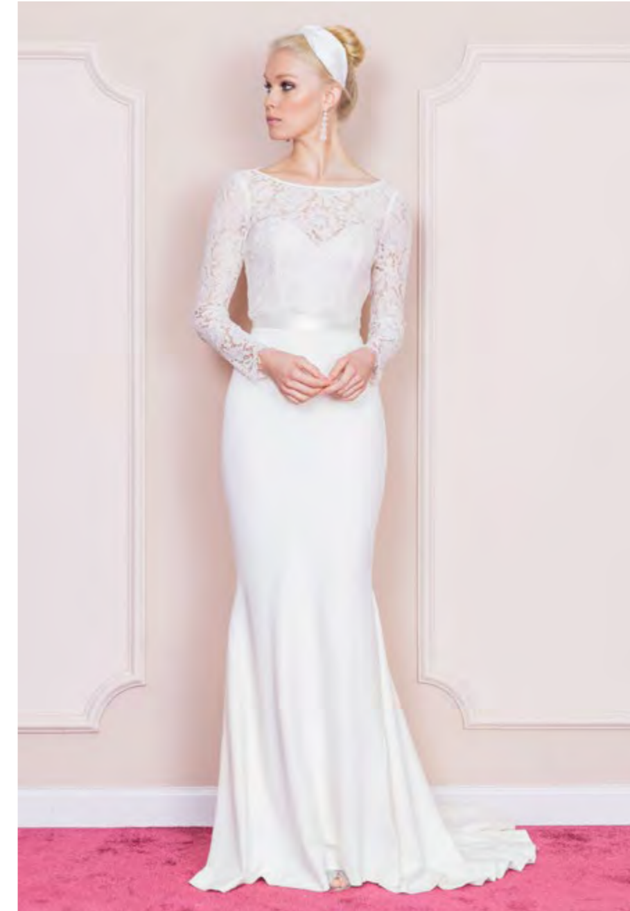
22013 Nour top / 20313 Corsett silk / 35265 Amelie skirt