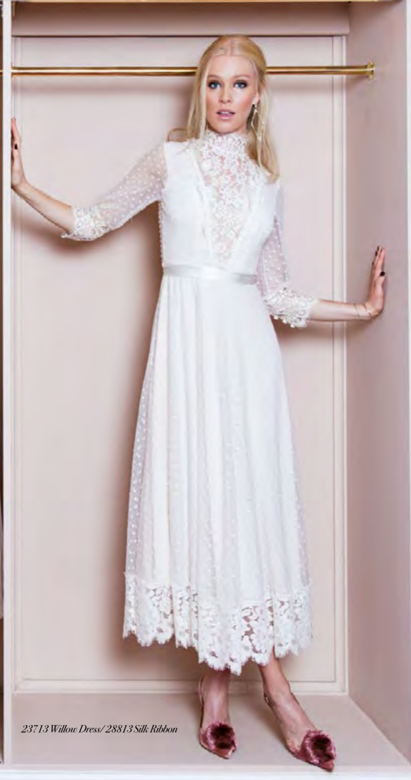
23713 Willow Dress/ 28813 Silk Ribbon