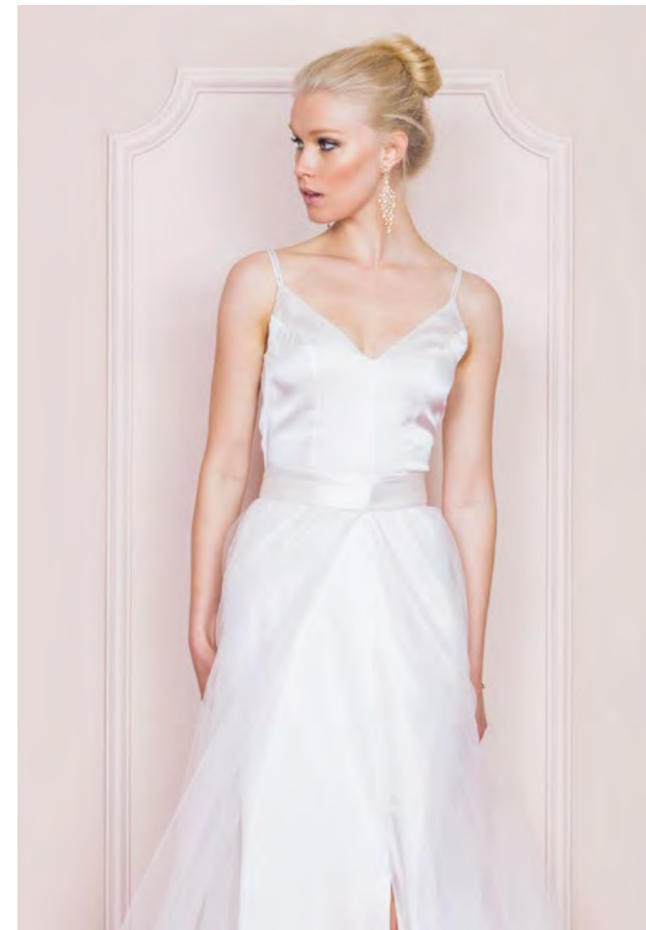
36765 Lulu Dress/ 37813 Dagmar skirt no lining