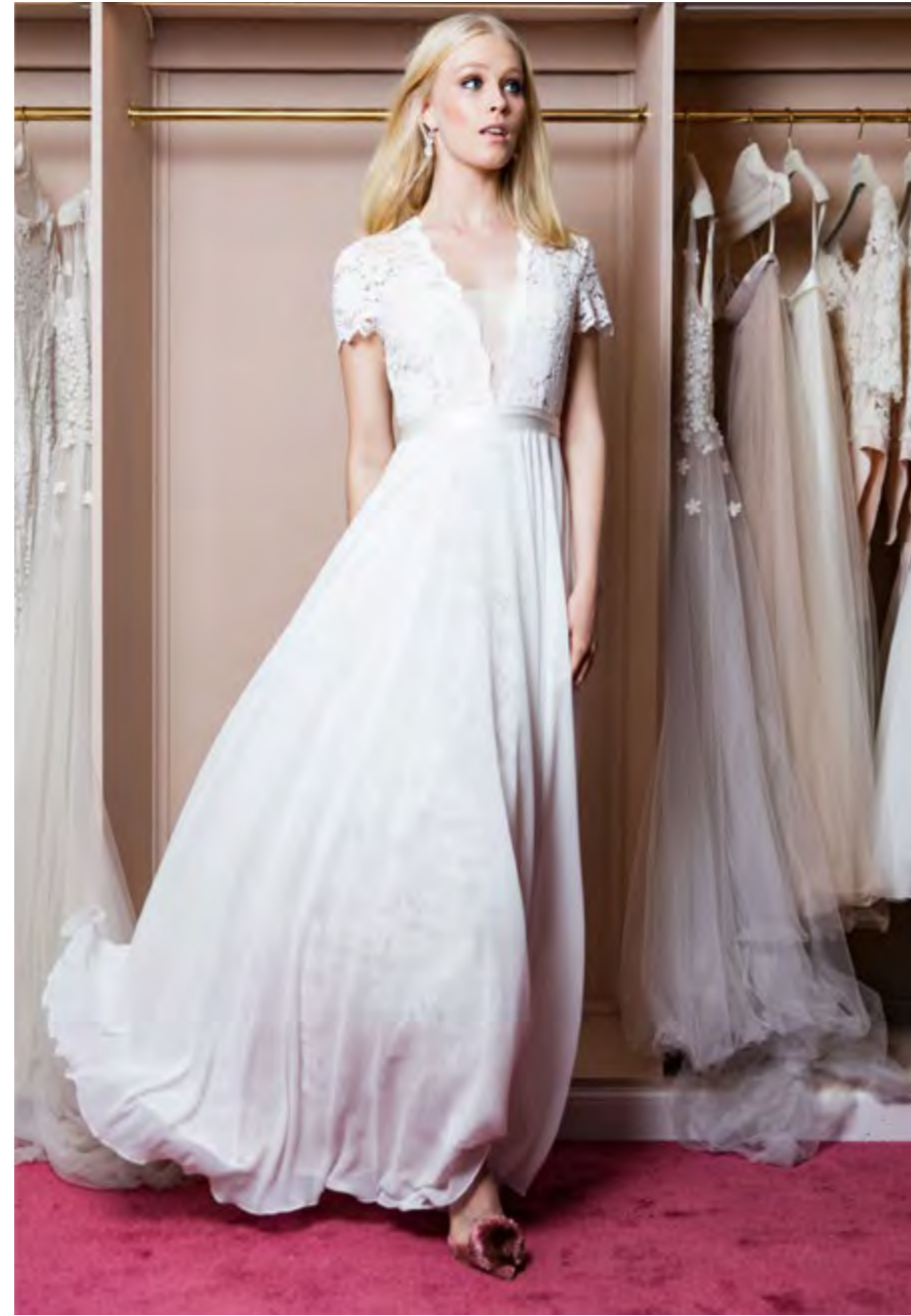
82365 Maya dress / 28865034 Silk Ribbon